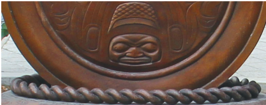
Detail of the rope element at the base of the medallion