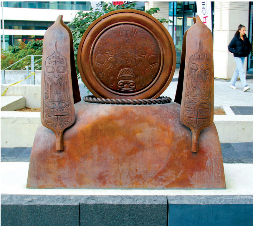
The sculpture in-situ on its plinth