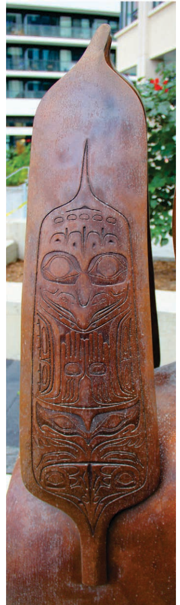
One of the four cast feathers, depicting an eagle