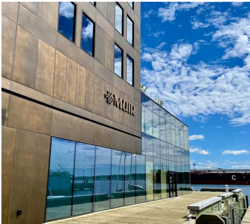
Patinaed curtain wall panels at the entrance to the Muir Hotel at Queen's Marquee