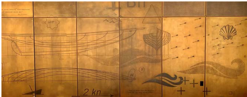
Patinaed Muntz panels with etched artwork spanning across multiple panels