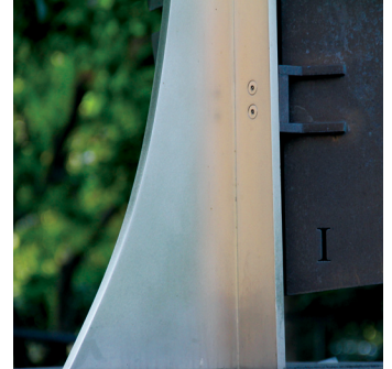
Detail of the Stainless Steel Mast

Highlights - A brushed stainless steel mast supports an array of (70) brushed and patinated fin panels. These work in unison as a part of and with the sundial on the monument base. The monument signifies the passage of time..