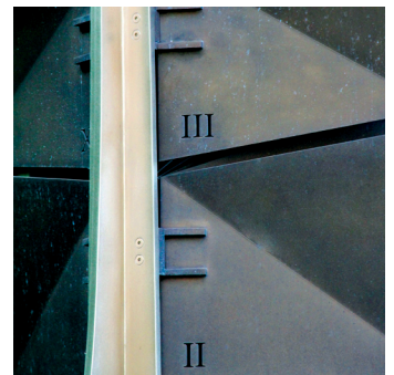
Detail of the fins from the back of the monument