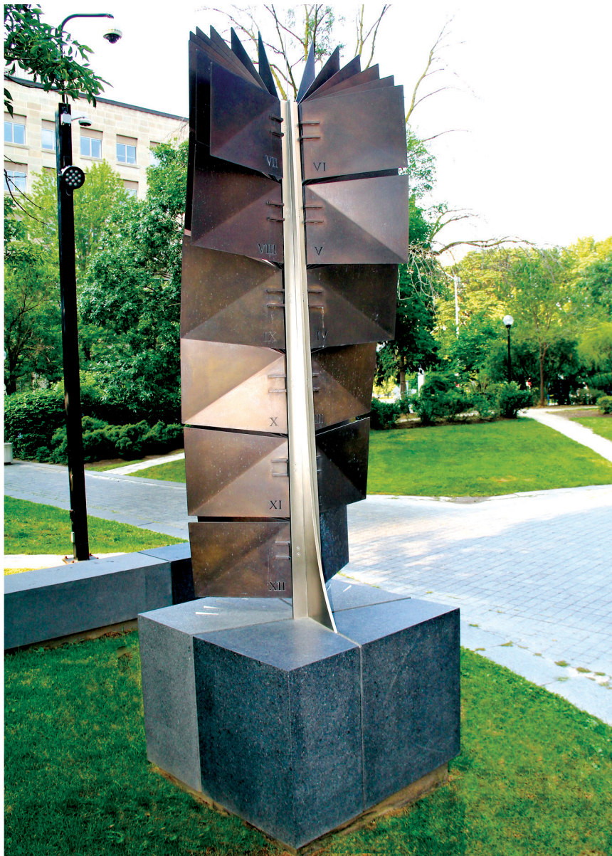
The Correctional Workers Monument "Hours of the Day"