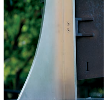
Detail of the Stainless Steel Mast

Highlights - A brushed stainless steel mast supports an array of (70) brushed and patinated fin panels. These work in unison as a part of and with the sundial on the monument base. The monument signifies the passage of time..