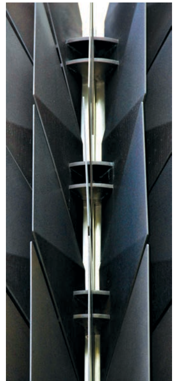
Detail of the fins attachment from the front view