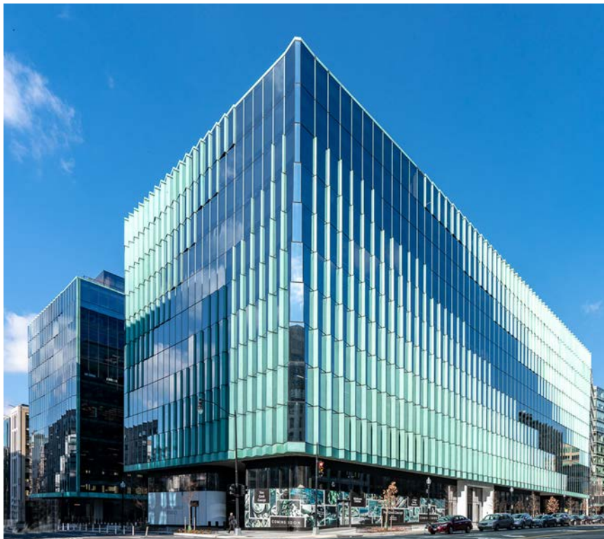
The Midtown Center at 1100 15th Street in Washington, DC.