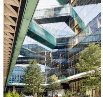
Detail of paneled bridges and trim

Highlights - Panels are of multiple different sizes and shapes made of 1.5mm thick, formed and patinated Copper panels. Patinated green copper panels placed over 3 phases that provide coverage of approximately 7000 sq. ft. Panels are mounted with alloy 316 stainless steel clips & stiffeners in .078" material thickness for durability. Also included is a painted aluminum trim and stiffener assembly along with approximately 50,000 copper clips.