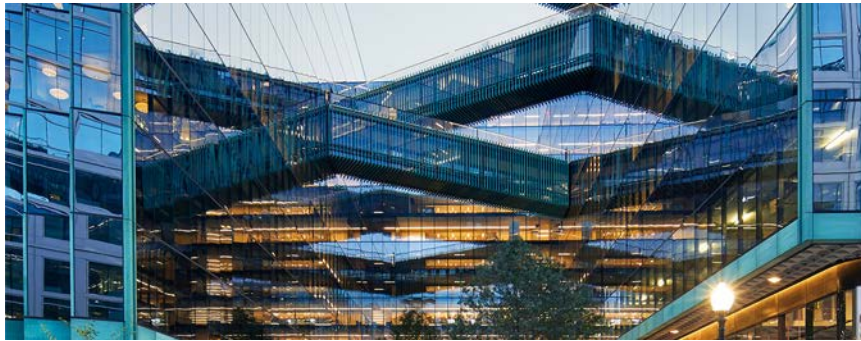
The Copper Paneled bridges that run between the two buildings comprising the Midtown Center