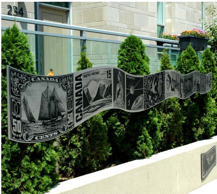
The Canada Post stamproll plaque and the title plaque in situ at 234 Adelaide Street West in Toronto