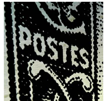
Detail of text etching and in-fill work