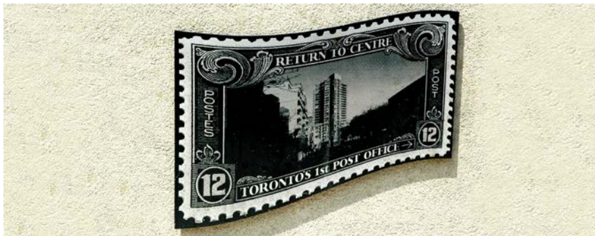
The title plaque located beneath the Canada Post stamp roll plaque.