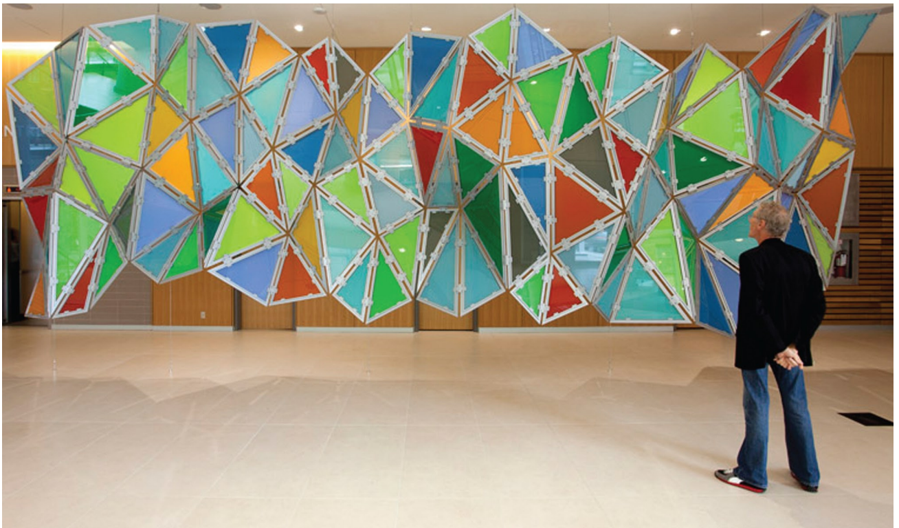
An observer stands in front of the public art work "Hive Brane"