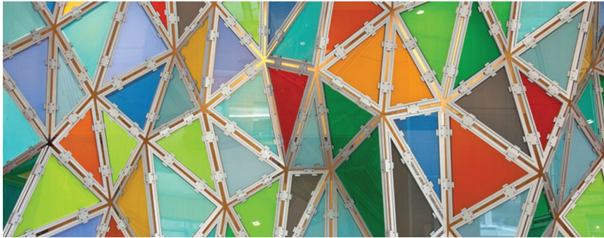
Detail of the construction of the artwork