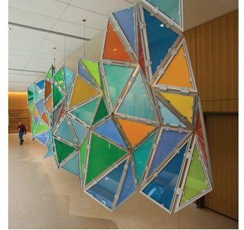
A view of the front of the artwork

Highlights - The artwork, entitled "Hive Brane" is 4 meters high by 10 meters long and 2.5 meters deep (12.5 feet high x 33 feet wide x 7 feet deep) and is constructed of 114 uniquely shaped isosceles triangle frames, fabricated in painted aluminum, within which is installed a palette of 14 colors of translucent custom-colored glass.