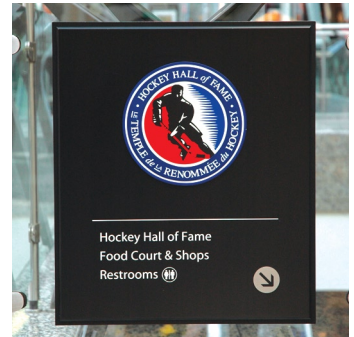
Painted & silkscreened wayfinding sign