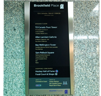
Stainless steel and glass elevator directory

Highlights - These directories and signs are varied in materials and design to suit the location they are in, within the Brookfield Place office complex. Materials range from 1/4" stainless steel and tempered 1/4" glass inserts for the upright brochure holders and directories to modern molded plastics and aluminum for wayfinding signage.