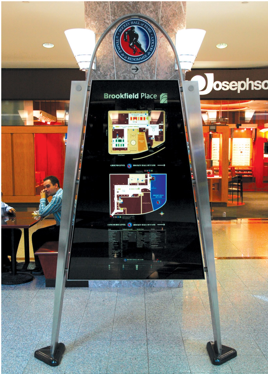
Floor mounted stainless steel & glass directory