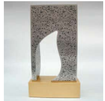
Back: etched and infilled mosaic pattern