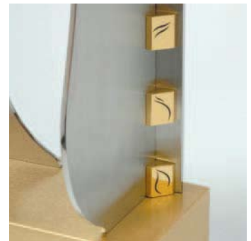
Etched and polished bronze rosettes