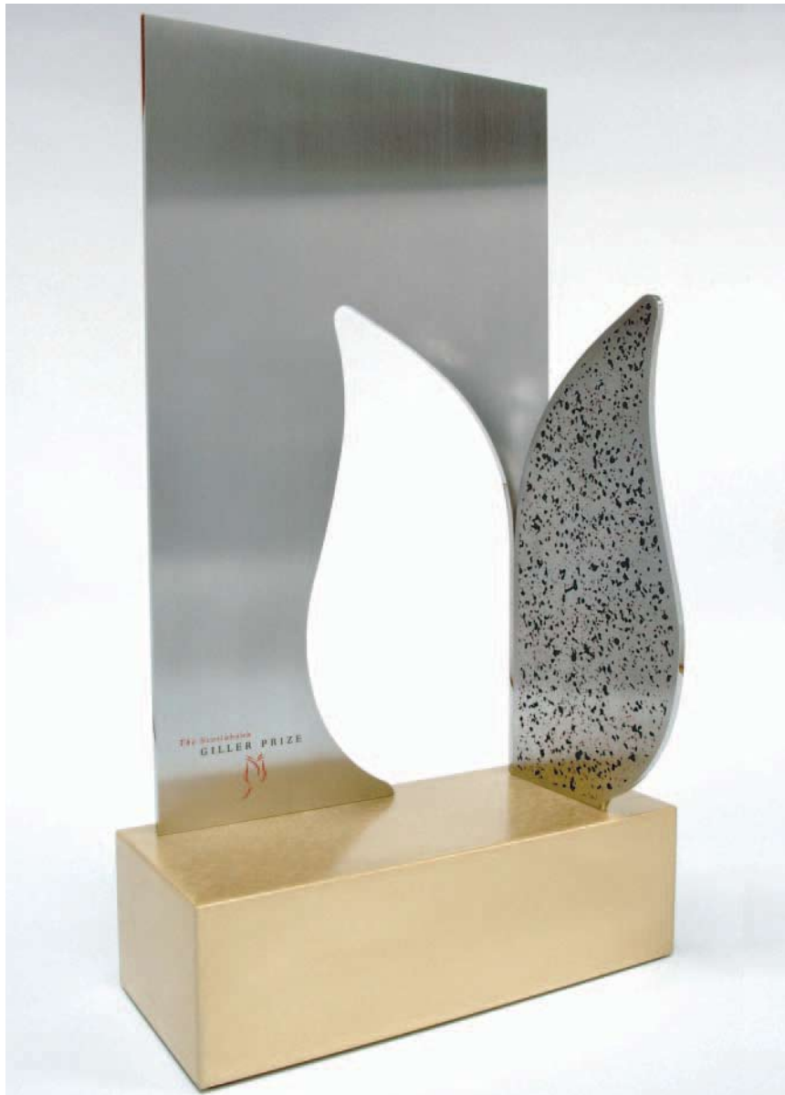
1/8" thick brushed st. steel, waterjet cut, etched and infilled atop an orbitally brushed bronze base

Highlights - Waterjet cut brushed and mirror polished stainless steel plate, etched with a repetitive mosaic pattern and affixed with decorative polished bronze rosettes, all mounted on a brushed bronze base.