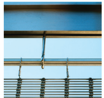
Mesh tensioning system