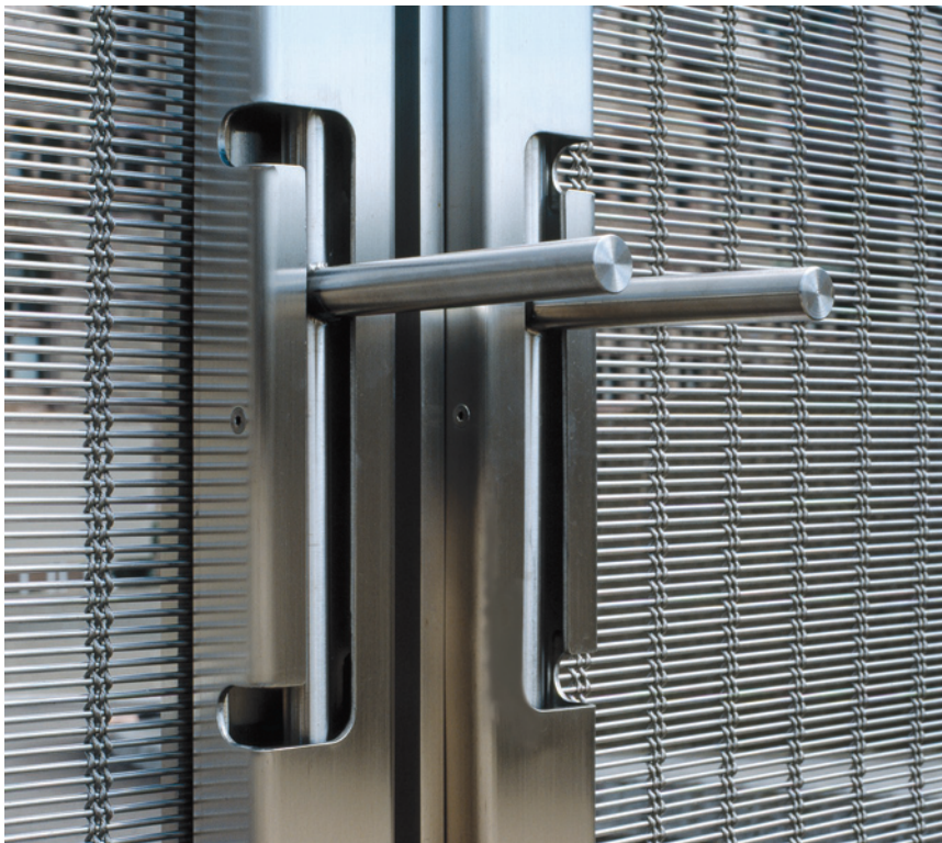
Down-bolts on south ramp gates