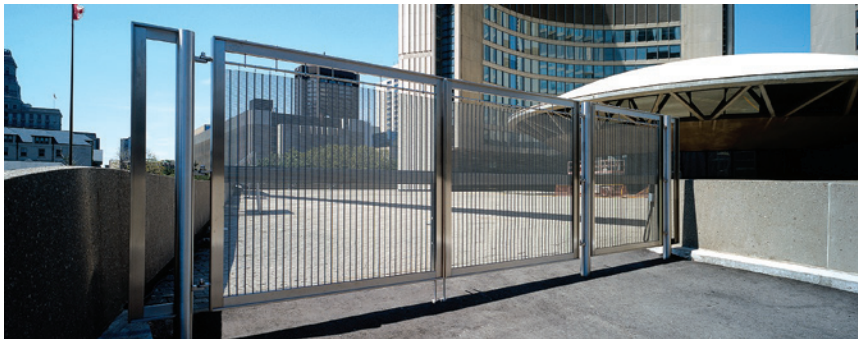
Gates at south ramp

Highlights - This project was featured on the cover of April's issue of Canadian Architect.