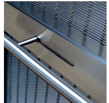
Sliding latch assembly