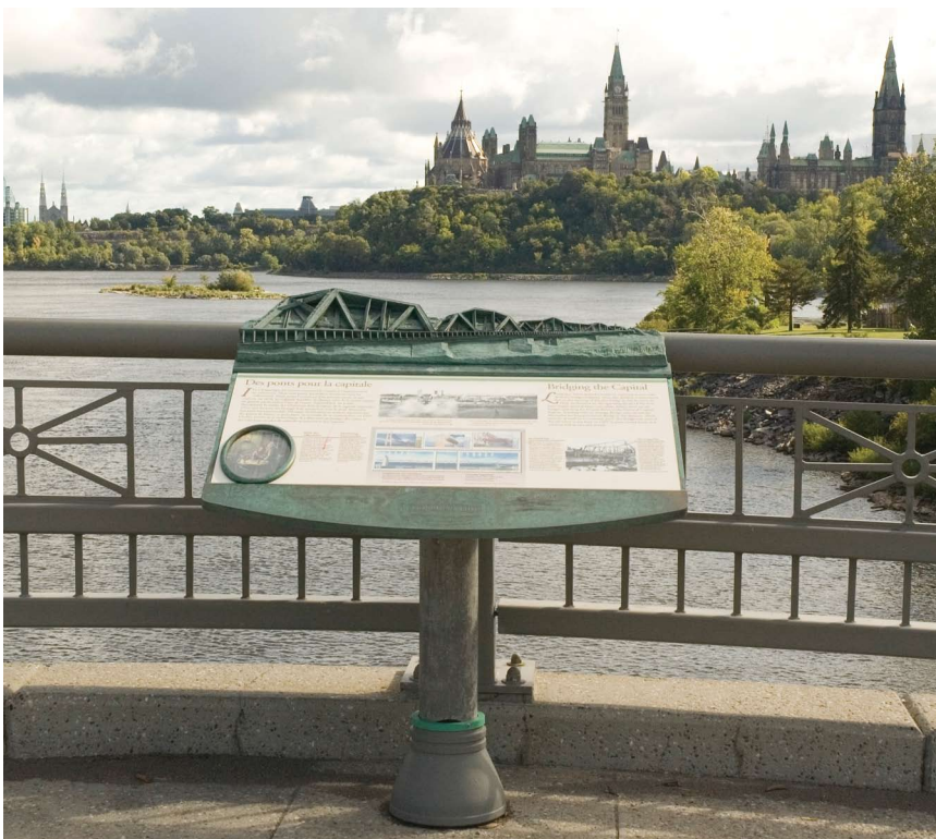
One of the (10) original Confederation Boulevard plaques overlooking the Ottawa river and Parliament buildings of Canada