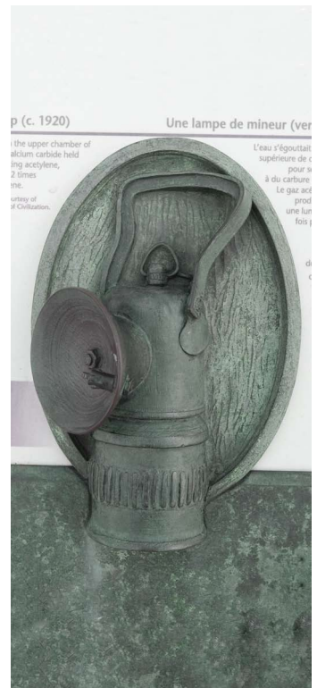
Highly detailed cast artifacts adorn these plaques